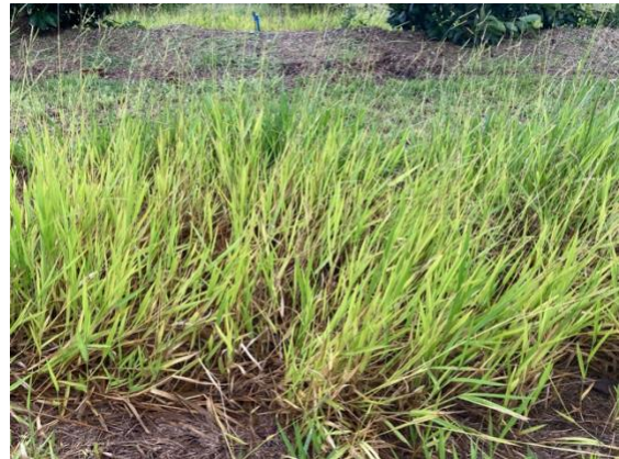
Image 1: Signal grass provides ground cover but is dominant in the avocado inter row. March 2021, prior to commencement of the trial.

exclusion of all other species (Image 1).