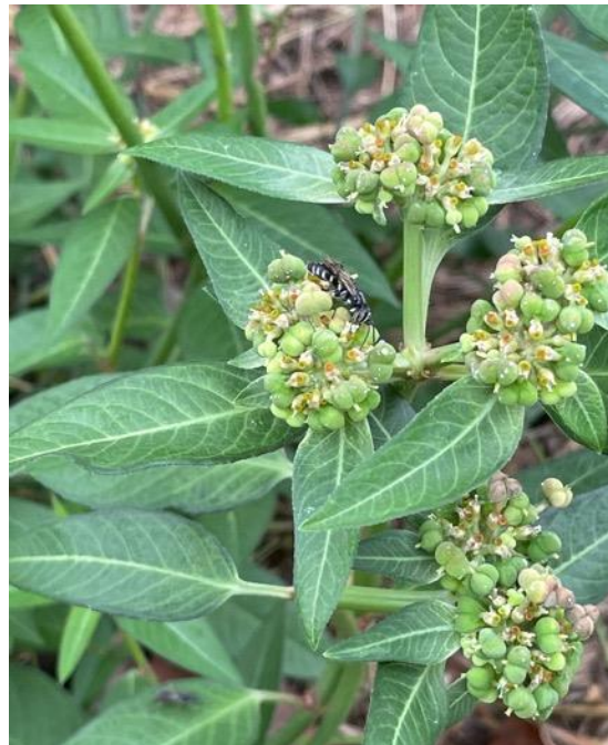
Image 5: March 2021, prior to seeding, beneficial insects including wasps are observed visiting inter row weeds.

Fruit spotting bug nymphs were found in some parts of the orchard with visible damage. Some of the weeds hosted parasitoid wasps and assassin bugs.