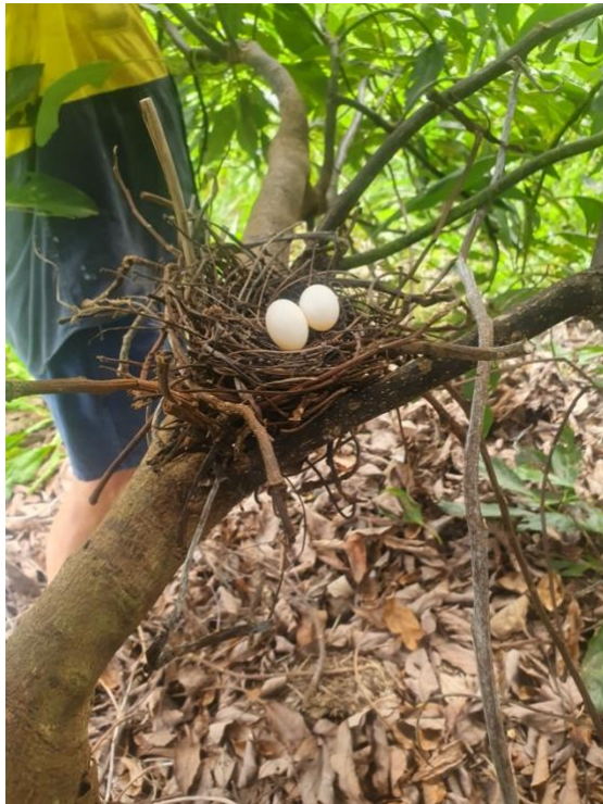
Image 14a: There were good indicators for biodiversity in the orchard during the life of the trial, with birds nesting in the orchard.

paying off for biodiversity overall. This can contribute to farm productivity and sustainability. Observations collected during the life of the trial provide evidence for spider and bird populations in the orchard, both of which can contribute to an IPM program (Images 14a & 14b). 8,9