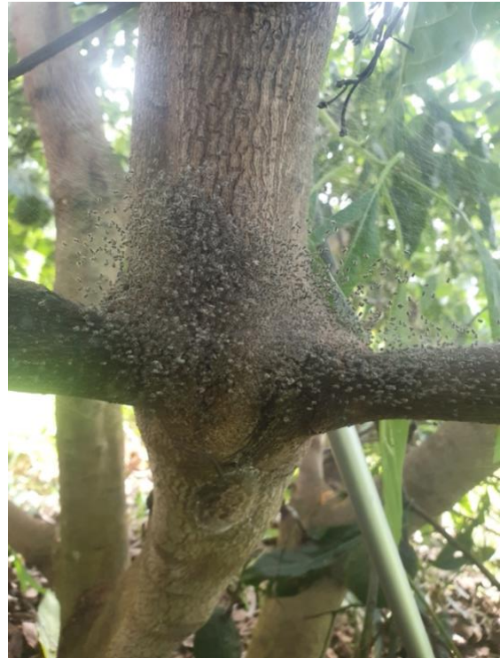
Image 14b: Spiders are completing their entire life-cycle in this orchard (spiderlings, above).

An initial survey found a range of beneficial insects including spiders, dragonflies and parasitoid wasps in the avocado trees. There was not much insect diversity in the signal grass. Certain weeds however were host to several wasps, assassin bugs and various fly species.