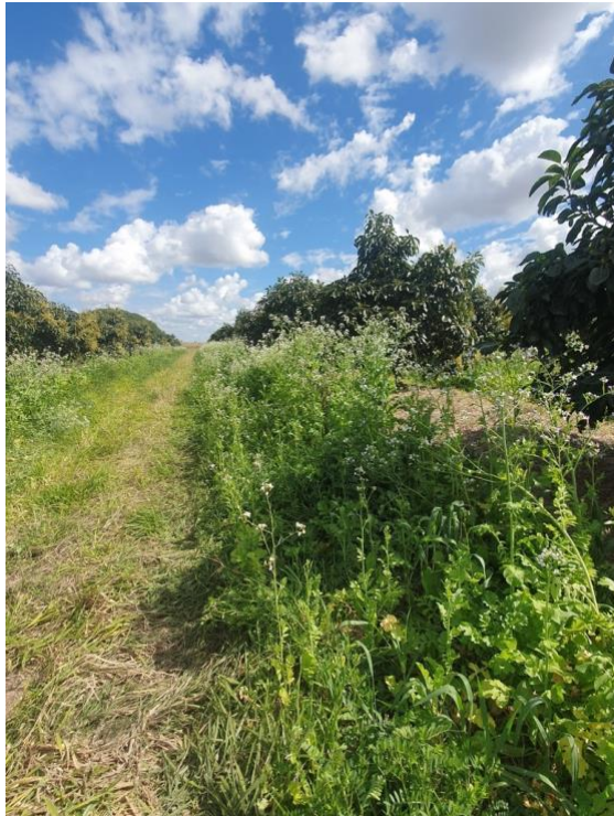
Image 8: August 2021, tillage radish in heavy flower and attracting bees into the inter row.