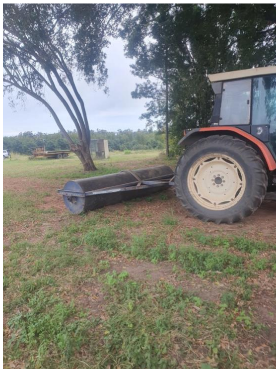
Image 13: During the life of the trial Clinton purchased a roller to lay down vegetation strips and allow for re-seeding and tree access while leaving living vegetation in place.

Seed mix #3 did not go ahead: the reasoning being that a number of biennial species were doing very well and did not require reseeding (tillage radish, chicory), while others had failed and were not suitable for the site at this time.